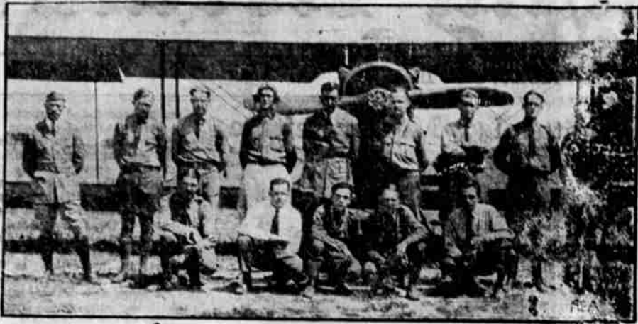
Aviators, circling over the flooded wastes of the Mississippi river, have saved thousands of lives. This group of Arkansas National Guard flyers, from Little Rock, helped in the rescue work by locating the homeless, many of whom were perched on housetops, narrow levees or in trees throughout the flood area.