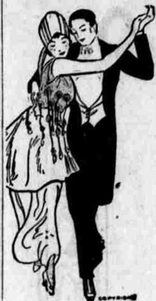
Two of the dancers in the "Jazzland Revue."