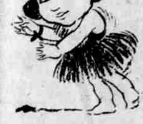
You'll get many a laugh from "Purple Flashes."

ON THE PORTLAND TRAIN Porter—"Shall I brush you off?" Andy Collier—"No; I'll step off in the usual manner." —PURPLE FLASHES—