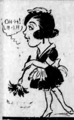
One of the Pony Chorus in "The Jazzland Revue."