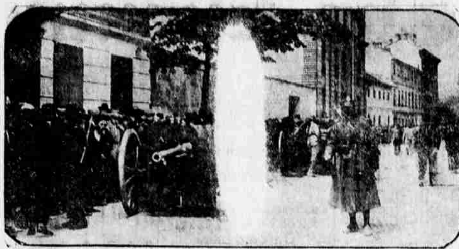
Casualties mounted into hundreds in Poland during Marshal Pilsudski's successful attempt to overthrow the Witos administration. This photo, first to reach America since the fighting, shows a crowd gathered at a revolutionary field gun planted in a Warsaw street.