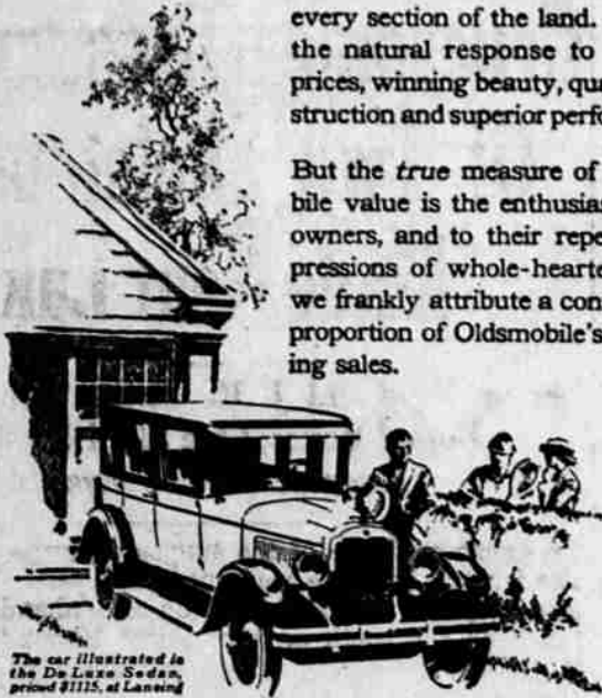
The car illustrated in the De Luxe Sedan, priced $1325, at Lansing

But the true measure of Oldsmobile value is the enthusiasm of its owners, and to their repeated expressions of whole-hearted praise we frankly attribute a considerable proportion of Oldsmobile's increasing sales.