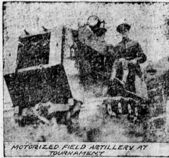
MOTORIZED FIELD ARTILLERY AT TOURNAMENT

OREGON AGRICULTURAL COLLEGE, Corvallis, May 21. — Nine Klamath Falls students will take part in several events of the fourteenth annual military tournament at O. A. C. May 29. By means of the tournament the military department each year shows the training it offers and the serious purpose the physically fit men of the college give to their work in the reserve corps.