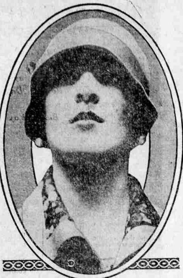
Miss Ernestine Calles, 13, daughter of President Calles of Mexico, is touring the United States. This photo was taken in New Orleans, where she admitted she is a flapper and said she is proud of it.

some of the gardens that were coming up. It is thought that the first strawberry blossoms were killed.