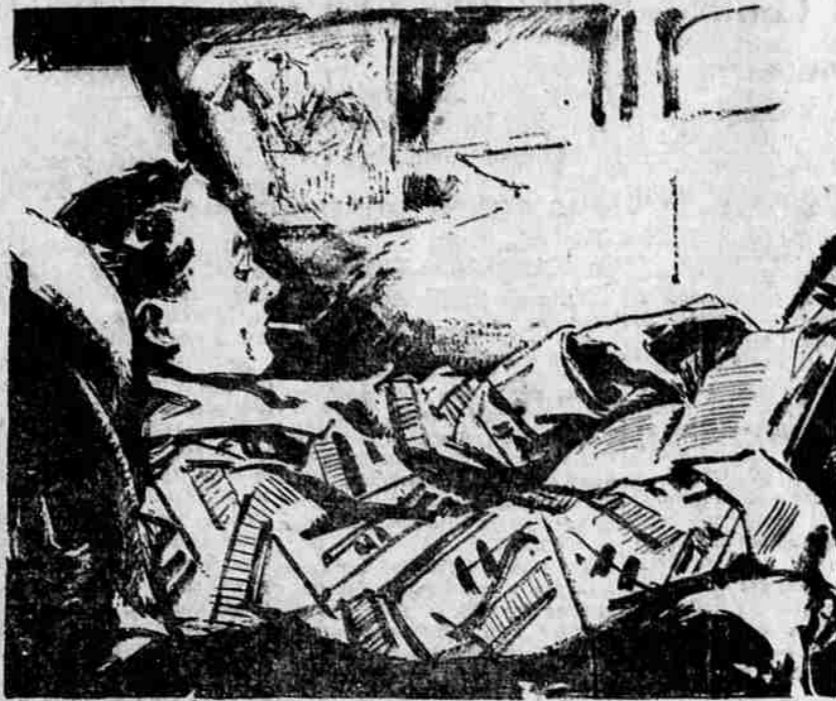
No other cigarette in the world is like Camels. Camels contain the choicest Turkish and domestic tobaccos. The Camel blend is the triumph of expert blenders. Even the Camel cigarette paper is the finest—made especially in France. Into this one brand of cigarettes is concentrated the experience and skill of the largest tobacco organization in the world.

When winter's snow is falling outside—and the wind roars through the trees—when the friendly logs blaze up in the fireplace—have a Camel!