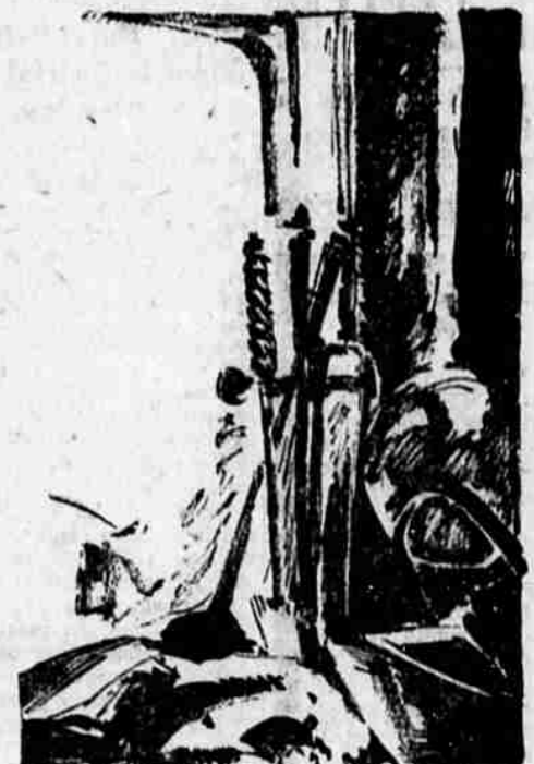
Our highest wish, if you do not yet know Camel quality, is that you try them. We invite you to compare Camels with any cigarette made at any price. R. J. Reynolds Tobacco Co.