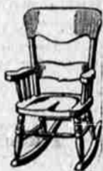
Golden Imitation Oak Rockers