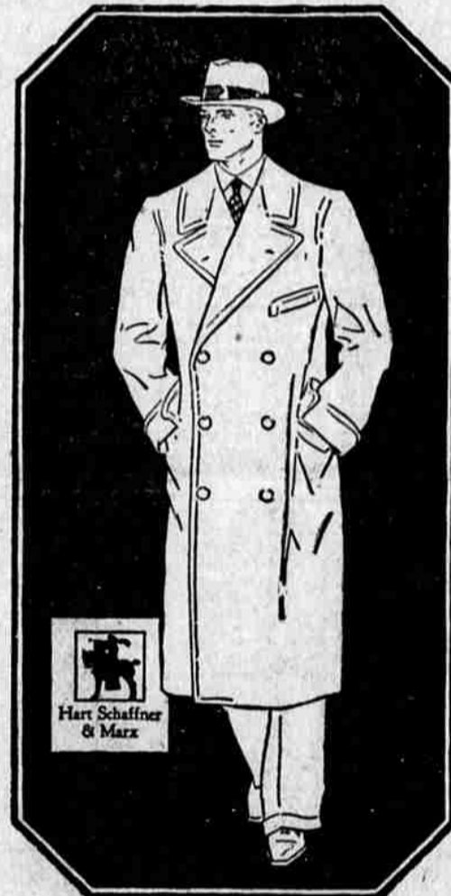
Copyright 1925 Hart Schaffner & Marx