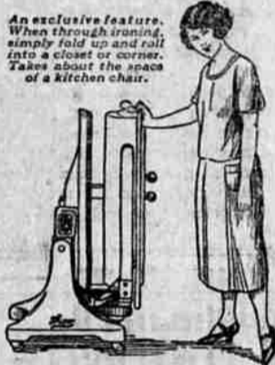
An exclusive feature. When through ironing, simply fold up and roll into a closet or corner. Takes about the space of a kitchen chair.

You can have a Thor Folding Ironer delivered now or on Xmas Eve for a small down payment; balance in small monthly amounts you'll never miss. But oh, the difference for your wife! Tear out this ad as a reminder to telephone or call in the morning.