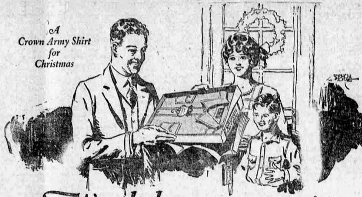
A Crown Army Shirt for Christmas

Big Price Reductions on Fur Coats at the Northern Fur Shop. (Adv) 15