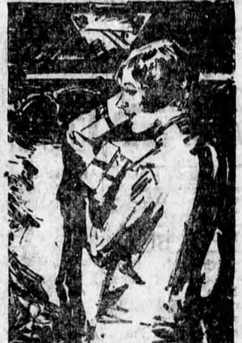
It is well to remember your few closest friends with a supply of Camels for Christmas Day and the days to come. Get your Camel cartons now and then they will be ready! R. J. Reynolds Tobacco Co.