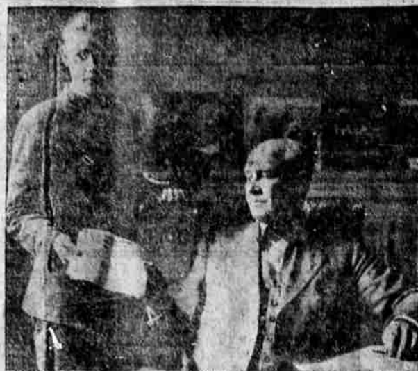
TELEGRAM SALEM OREGON NOVEMBER 26, 1925

"The Eternally Accursed," a 3-reel motion picture of life in Siam, will be shown at the evening service at the Presbyterian church tomorrow. This picture was made when the producers of the Orient were meeting in Bangkok, Siam, several years ago, and tells of the experience of a Siamese farmer who contracted the dread disease of leprosy, of his persecutions and wanderings until finally he found a refuge in the leper asylum provided by the gifts of Christian Americans. The public is invited.