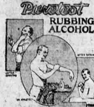
A Daily Need in Every Home

Doctors and nurses use rubbing alcohol for aches and pains, lames and bruises, and dozens of other purposes. Pints 75c