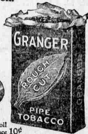
Packed in heavy foil instead of tins—hence 10¢