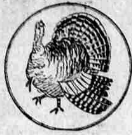
Table Linen Ready for Thanksgiving

Thanksgiving time, when all of the family come from far and near to feast at your table, is of all times the greatest strain on your supply of table linen. Our linen stocks are filled with beautiful, snowy, full-sized table cloths for the dinner itself. Luncheon sets for smaller affairs. You may need a new table pad too.