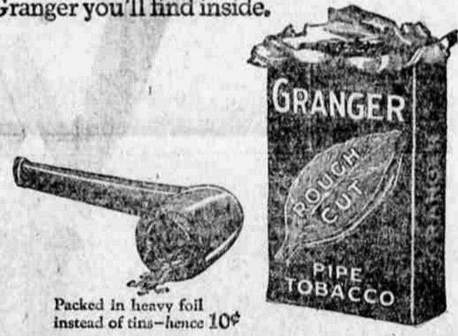
Packed in heavy foil instead of tins—hence 10¢

Eliminating the tin takes five cents off Granger's price Compare Granger with any tobacco made, for taste, for richness, for coolness—then compare it for price! Instead of costly tins, a foil package, and hence a straight saving of five cents.