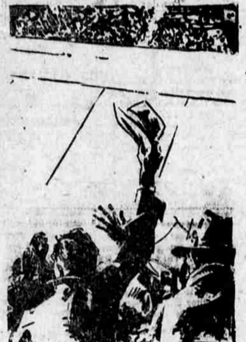
Our highest wish, if you do not yet know Camel quality, is that you try them. We invite you to compare Camels with any cigarette made at any price. R. J. Reynolds Tobacco Co.