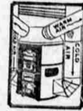
Montag Complete Installation, showing water boiler, oil boiler, or steam boiler, and with a wide range of capacities, depending on size of boiler.