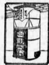
Montag Furnace with steam boiler, showing a wide range of capacities, depending on size of boiler.