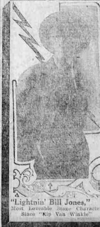
"Lightnin' Bill Jones," Most Lovable Stage Character Since "Kip Van Winkle"

Box office open 12 o'clock Monday. Mail orders now. Admission 50c, $1.10, $1.65, $2.20—includes war tax.