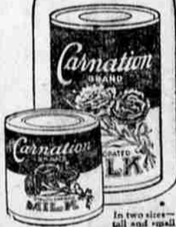
In two sizes—tall and small

IMPROVED! New with that finer-than-ever taste