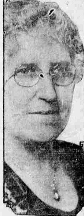
The second woman to sit in the U. S. Senate may be Mrs. Rebecca Felton, widow of the late North Dakota senator.

CLASSIFIED AD RATES First insertion per line 10c Two insertions per line 15c Four insertions per line 25c Week (6 times) per line 30c One month per line 75c