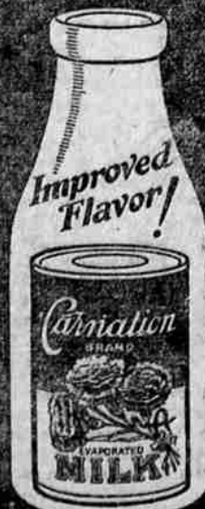
"From Cesterized Cows"