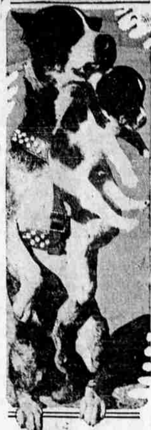
Pat, famous movie dog actor, almost went on strike the other day. He refused to appear in a movie unless his son, Pat Jr., could have a part too, and he carried the pup to the lot to make sure they'd give him a chance.