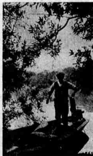
A COMMON SIGHT