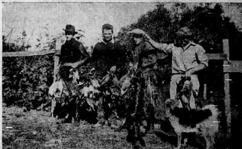
DUCKS FOR EVERYONE