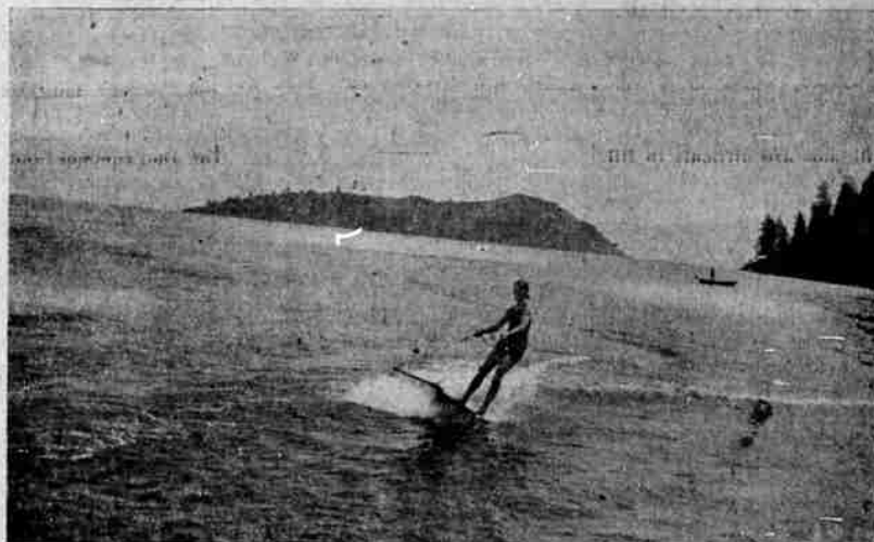
FOR THOSE WITH STEADY NERVES