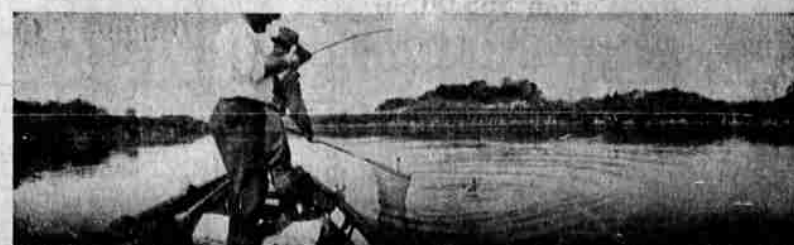
ANOTHER BIG ONE