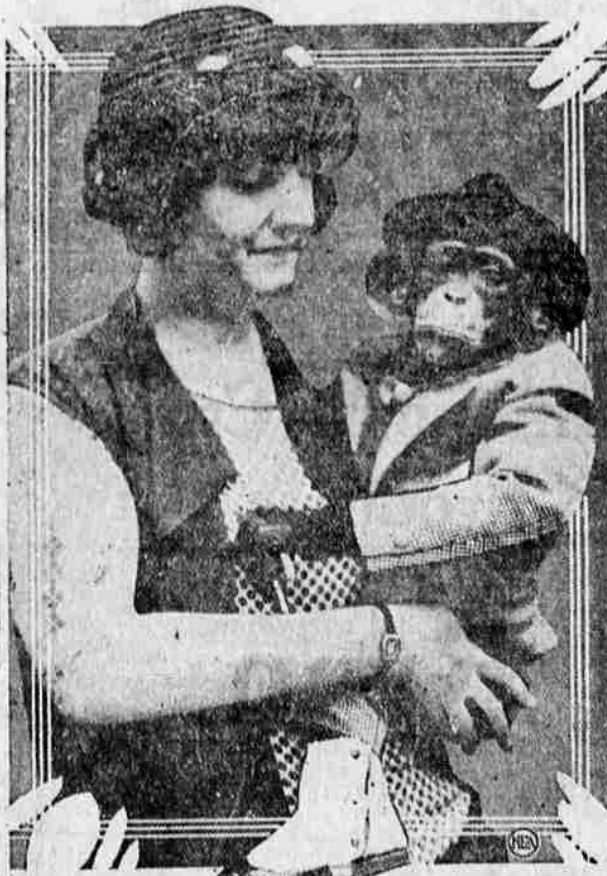
This lady and her simian friend gave Dayton, Tenn., a stiff jolt when they strolled down towards the courtroom where the evolution trial was in session. The monkey, taking plenty of long looks around, had the time of his life.