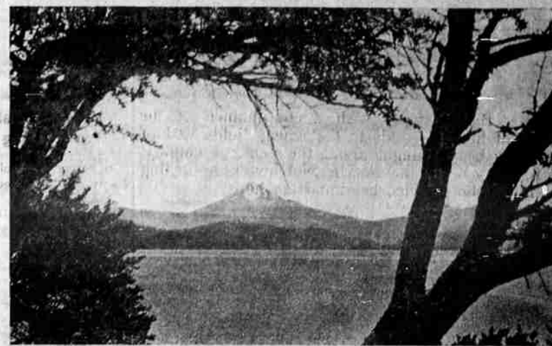
A CHARACTERISTIC LAKE VIEW

For those who wish to isolate themselves, there are camping spots available in between.