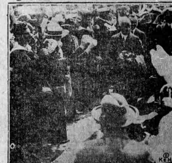
Raold Amundsen, bearing a bouquet of flowers, received a tumultuous greeting on landing in Oslo, capital of Norway. He is seen here making his way through lines of cheering citizens, with Lincoln Ellsworth, his American companion, directly behind him.