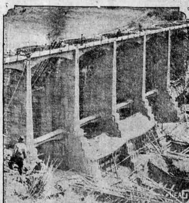
Salt Lake City is more than usually interested in the condition of this dam, which some engineers declare unsafe. It is under construction at Leil Mountain, Utah, 15 miles from Salt Lake City, and if it should collapse it would turn 500,000,000 gallons of water on the city. New tests of its strength are being made.