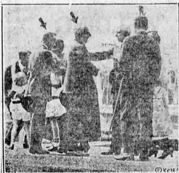
Raold Amundsen and Lincoln Ellsworth met an enthusiastic crowd when they landed at the Bridge of Honor in Oslo, Norway, where representatives of the king waited to take them to the palace. Ellsworth is shown at the left with Amundsen beside him, both indicated by arrows.