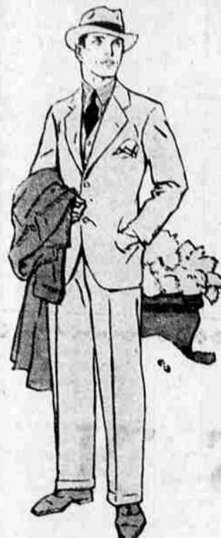
© 1925 Hart Schaffner & Marx

Every Summer Suit in Stock, Including Hart Schaffner & Marx, Included in This Clearance