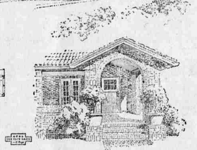
House No. 610 Designed for American Face Brick Association

THE popularity of the one-story house continues unabated in all parts of the country. The artistic possibilities in houses of this character have not always been realized, but in the last few years more and more charming bungalows are being built.