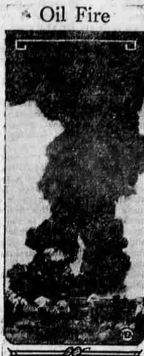
Oil Fire A bolt of lightning struck a 55,000-barrel tank of oil at El Dorado, Kas., and here's what happened. The smoke cloud shot 500 feet up in the air and kept the town in semi-darkness all day.

CLASSIFIED AD RATES First insertion .....per line 10c Two insertions .....per line 15c Three insertions .....per line 20c Four insertions .....per line 25c Week (6 times) .....per line 90c One Month .....per line 75c Minimum charge 25c. Ads not consecutive are charged as new following each omission. First insertion in "New Today" column without extra charge, but all insertions in that column are at first insertion rate. Display classified ads (where type larger than this is used) are counted nine lines to inch. Copy must be in Herald office by noon to get in that day's paper.