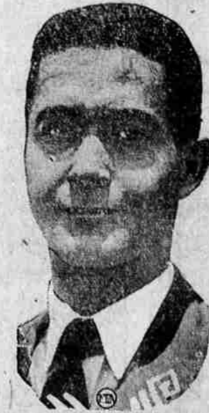
This man will have a lot of intimate dealings with the troublous times in China during the next months. He is John Vaa A. Mac Murray, and he has just been appointed U. S. minister to China.