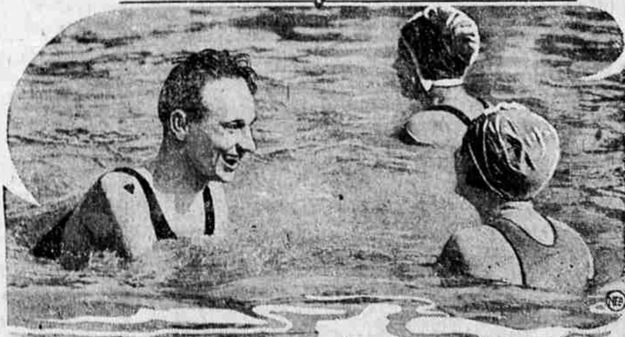
John T. Scopes is going on trial in Dayton, Tenn., on July 10 for teaching evolution, but meanwhile he isn't worrying greatly about it. Here he's shown taking a dip in the old swimming pool near Dayton. And he doesn't have to swim alone, either, you'll note.

TOWN SCINTILLATES WHEN OXFORD BOYS DOLL UP OXFORD, Eng. — For several years past Oxford men of adventurous character have been experimenting with new fashions in evening clothes. They have tried coats without tails, and coats with white lapels, and double breasted coats with knee breeches, but always in vain.