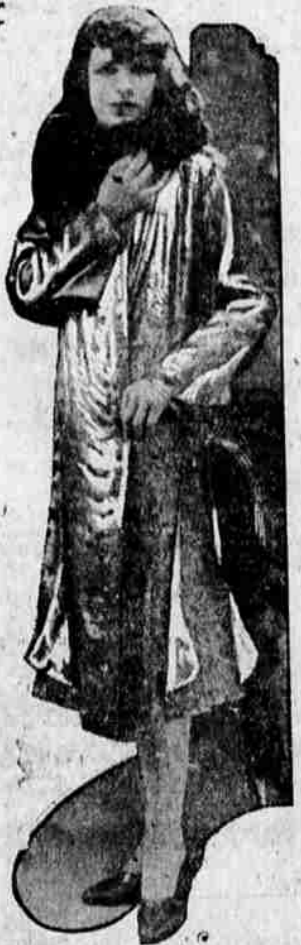
TRIANGULAR Jabots of plain silver cloth trim the skirt and sleeves of this coat of embroidered tulle that is collared with black fox. This is the type of wrap Paris prefers for evening instead of the more voluminous cape or full coat.