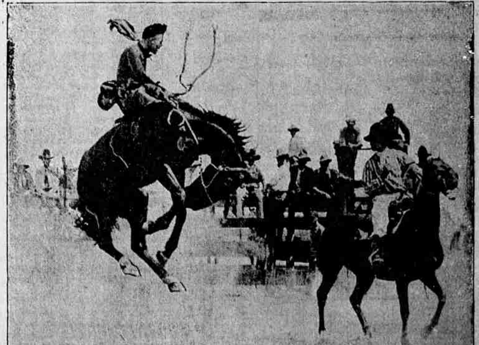
Some of the best bucking horses in the west are strutting their stuff at the Rodeo this year. If you want all there is in the way of round-up thrills, you can't beat the Rodeo at the fair grounds. Go out this afternoon and tomorrow and see just how good these bucking horses really are.