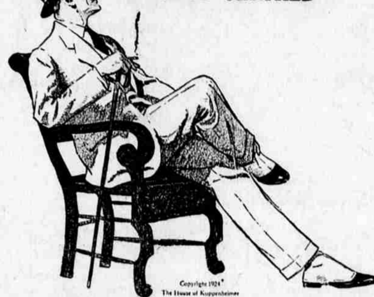
Copyright 1924 The House of Kuppenheimer

For the Rodeo—and July the 4th—celebrations you will want to look and feel at your best and you can do it in one of our Fine Kuppenheimer Summer two and three piece suits, in Tweeds, Gaberdines and Worsteds—All the new shadings and fabrics—from $30 to $40—Step in, look over and try on some of these fine suits.