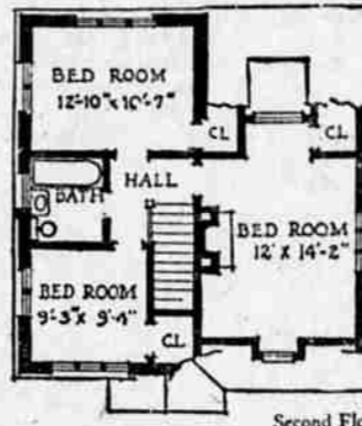
House No. 102