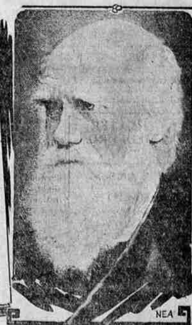
This is what started all the trouble. It is a page from George W. Hunter's "Civic Biology" text book, which John T. Scopes used in his classes at Dayton, Tenn., and for which he was indicted as a violator of the anti-evolution law. Accompanying is a picture of Charles Darwin.