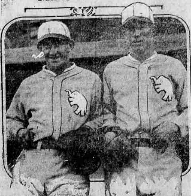
Here's the "million dollar" battery of the Philadelphia Athletics, Gordon Cochrane and "Lety" Groves. Of course, the players didn't bring that sum in actual money. It's just a phrase, though they did cost the crafty Connie Mack over $100,000 in the well known cold cash. Mack expects great things of the pair, however. Cochrane, catcher, is left in the accompanying picture.