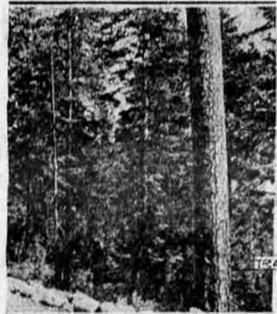
The new Ashland-Klamath Falls highway through the Pine Forest.