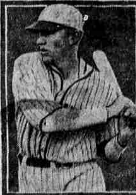
Fame is fleeting in baseball. Last fall Harold Lindstrom (shown above) was one of the outstanding stars on the New York Giants' roster in the world series games. At third base and at bat he was a near sensation. When the 1925 season opens Lindstrom, however, will be on the bench, an understudy to Heinie Groh, the veteran.