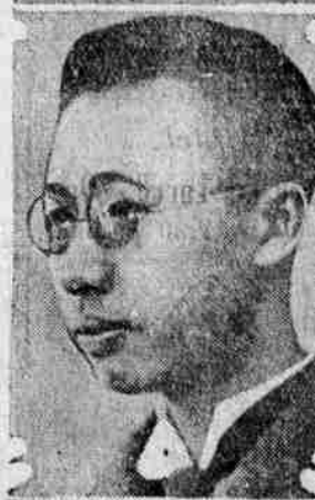
His Majesty Huanan Tung, deposed Manchu emperor, who was granted a yearly income of four million dollars and control of the city of Peking when dethroned in the first Chinese revolution and who later was deprived of all holdings, is contemplating a visit to the United States.