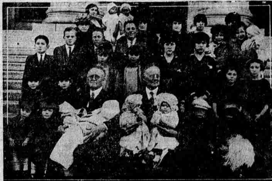
Luther Burbank's plant creations are not the only things that flourish in Santa Rosa, Calif. Here are 16 sets of twins, residents of Santa Rosa, Calif., ranging in ages from three months to three score years.