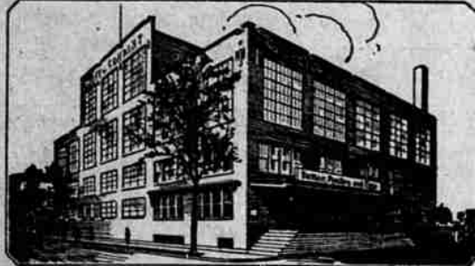
Swift & Company Produce Plant, Nashville, Tenn.

Buick and Star Garage Opposite White Pelican Hotel