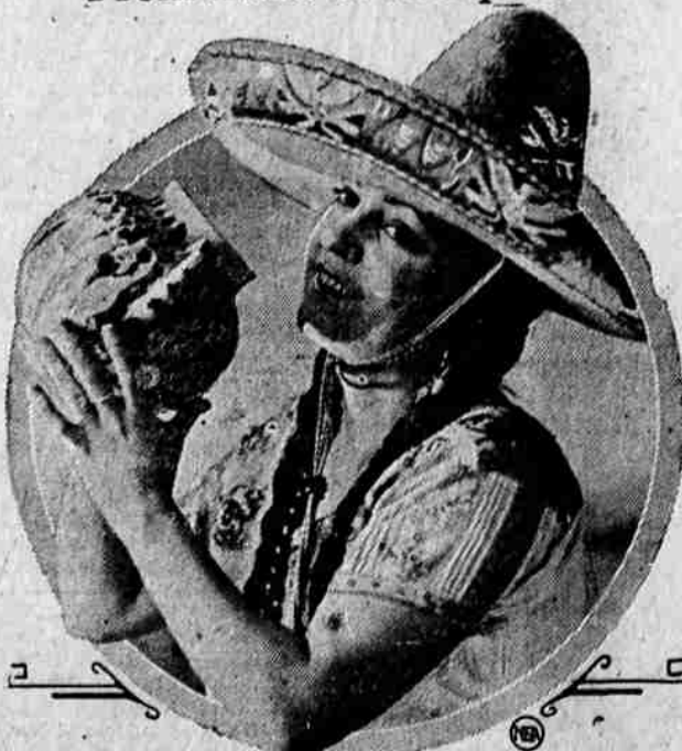
Maria Conesa, highest-priced Mexican actress, will soon be seen in a Spanish play on the American stage. Here she is shown in a typical Mexican costume.