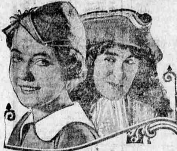
Betty Bronson and Ernest Torrence in the Herbert Brenon Production of J.M. Barrie's "Peter Pan" A Paramount Picture