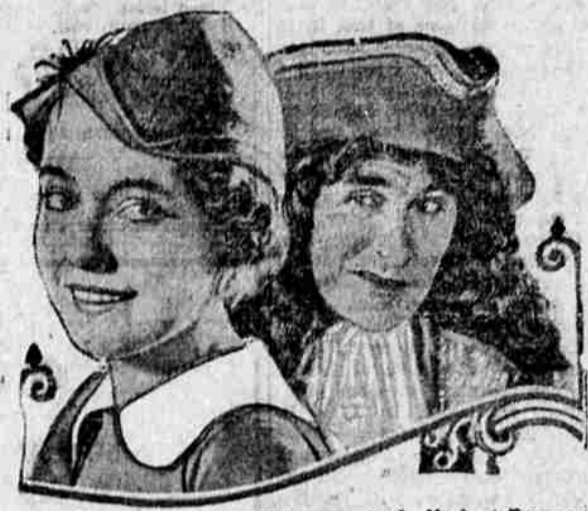
Betty Bronson and Ernest Torrence in the Herbert Brenon Production of J. M. Barrie's "Peter Pan" A Paramount Picture