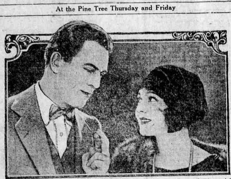
Thomas Meighan and Lila Lee in the Paramount Picture "Coming Through"

IF RHEUMATIC BEGIN ON SALTS Stay off the damp ground, avoid exposure, keep feet dry, eat no sweets of any kind for a while, drink lots of water and above all take a spoonful of Jad Salts occasionally to help keep down uric and toxic acids. Rheumatism is caused by poison toxins, called acids, which are generated in the bowels and absorbed into the blood. It is the function of the kidneys to filter this acid from the blood and cast it out in the urine. The pores of the skin are also a means of freeing the blood of this impurity. In damp and chilly, cold weather the skin pores are closed, thus forcing the kidneys to do double work; they become weak and sluggish and fail to eliminate this poison, which keeps accumulating and circulating through the system, eventually settling in the joints and muscles, causing stiffness, soreness and pain, called rheumatism. At the first twinge of rheumatism get from any pharmacy about four ounces of Jad Salts; put a table-spoonful in a glass of water and drink before breakfast each morning for a week. This is helpful to neutralize acidity, remove body waste also to stimulate the kidneys, thus helping to rid the blood of these rheumatic poisons. Jad Salts is inexpensive, and is made from the acid of grapes and lemon juice, combined with lithia, and is used with excellent results by thousands of folks who are subject to rheumatism.—Adv.