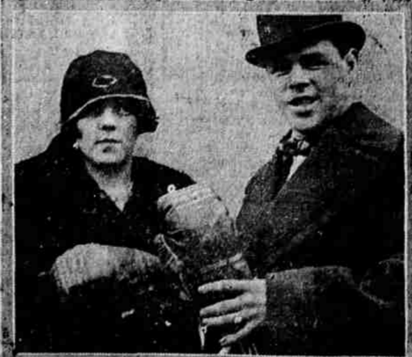
Showing Mickey Walker, welterweight champion and his wife as they appeared at the White House recently to present President Coolidge with a pair of autographed boxing gloves. The little holder looks a bit different in his calling clothes, doesn't he?