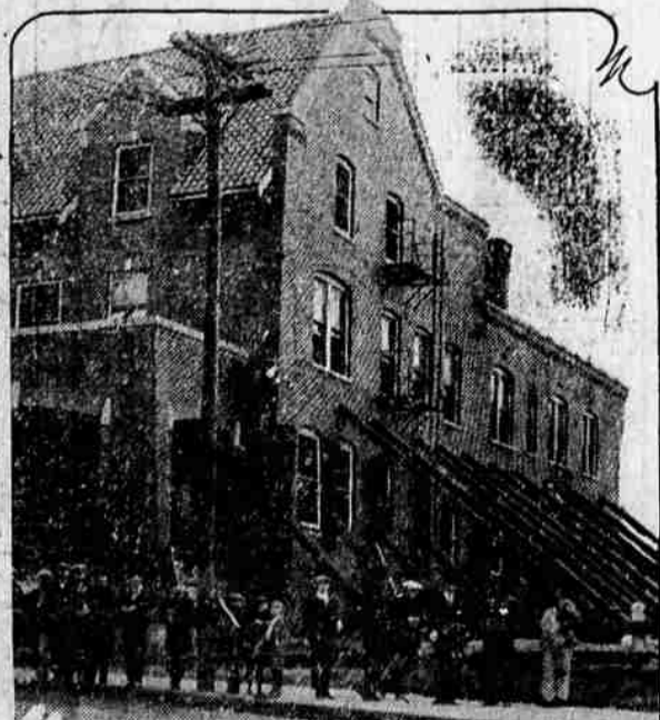
Citizens of Halleyville, Okla., were thrown into a panic when the Y. M. C. A. dropped three feet on its foundations into a tunnel of the abandoned Halleyville mine. The building is being saved by props.