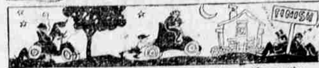
A product of the factories of the Maxwell Motor Corporation of twenty years ago.

By WALTER P. CHRYSLER, President and Chairman of the Board of Directors of the Maxwell and Chrysler Motor Corporation.