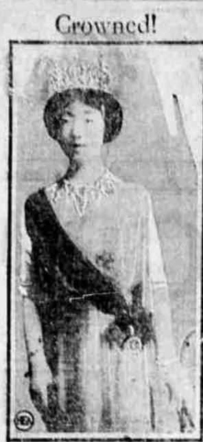
Photo shows Crown Princess Nagako of Japan, taken after her recent marriage to the prince regent.

For the first time in many years a liner, the Oropson, set to sea from Liverpool with the crew and passengers "clantey" singing "Down to Rio" as in the old days of the sailing lugger. During the 19,000 mile trip chanteys will be sung.