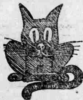
A Kris Kringle Thought.

"Dis Hyar worl' got a heap o' trouble into hit," said Charcoal Eph, ruminatively, "but somehow, hit don't seem lak dey is enough trouble." "Keep Santa Claus 'n comin' regular once a year."