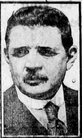
Edouard Herriott, mayor of Lyons, France, was over here on a visit. Photo snapped just before he is hailed as the next premier of France.

A consignment of oak was sent to Europe. It was found to be wormy and there was no market for it until the consignor happened to visit an antique furniture factory. The manager of the factory was busy engaged in manufacturing "antique" grandfather clocks, boring the wormholes by hand. He was very glad to buy the wormy oak and paid a much better price for it than for sound oak. A profitable connection was established between the exporter and the antique manufacturer.